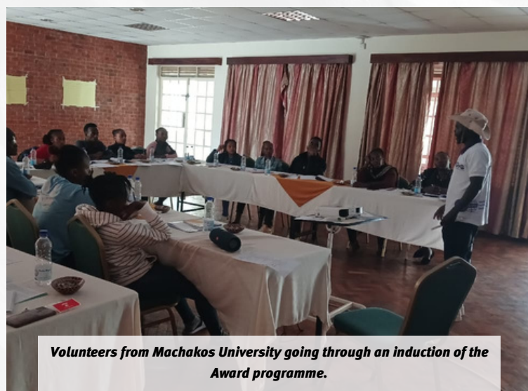
Volunteers from Machakos University going through an induction of the Award programme.

This outreach to colleges and institutes of higher learning is a strategic step towards ensuring a brighter future for the PA-K program. With a well-equipped network of individuals committed to its values, the program can reach even more young Kenyans, empowering them to discover their infinite potential and become responsible citizens who contribute positively to their communities and the nation.