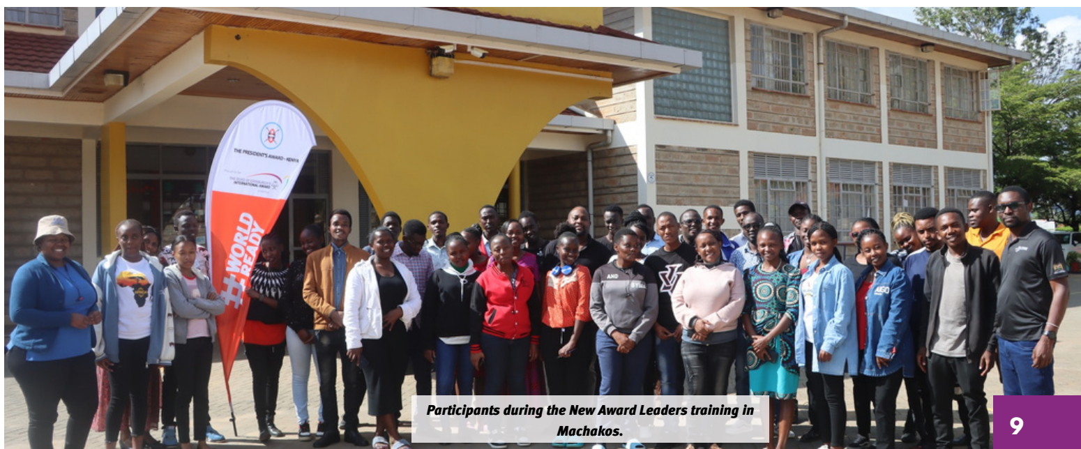
Participants during the New Award Leaders training in Machakos.

The President's Award-Kenya (PA-K) is investing in its future! Over 40 enthusiastic students from five Kenya Medical Training Colleges (Mwingi, Kagundo, Kitui, Makindu and Makueni) embarked on a journey to become the next generation of Award Leaders.