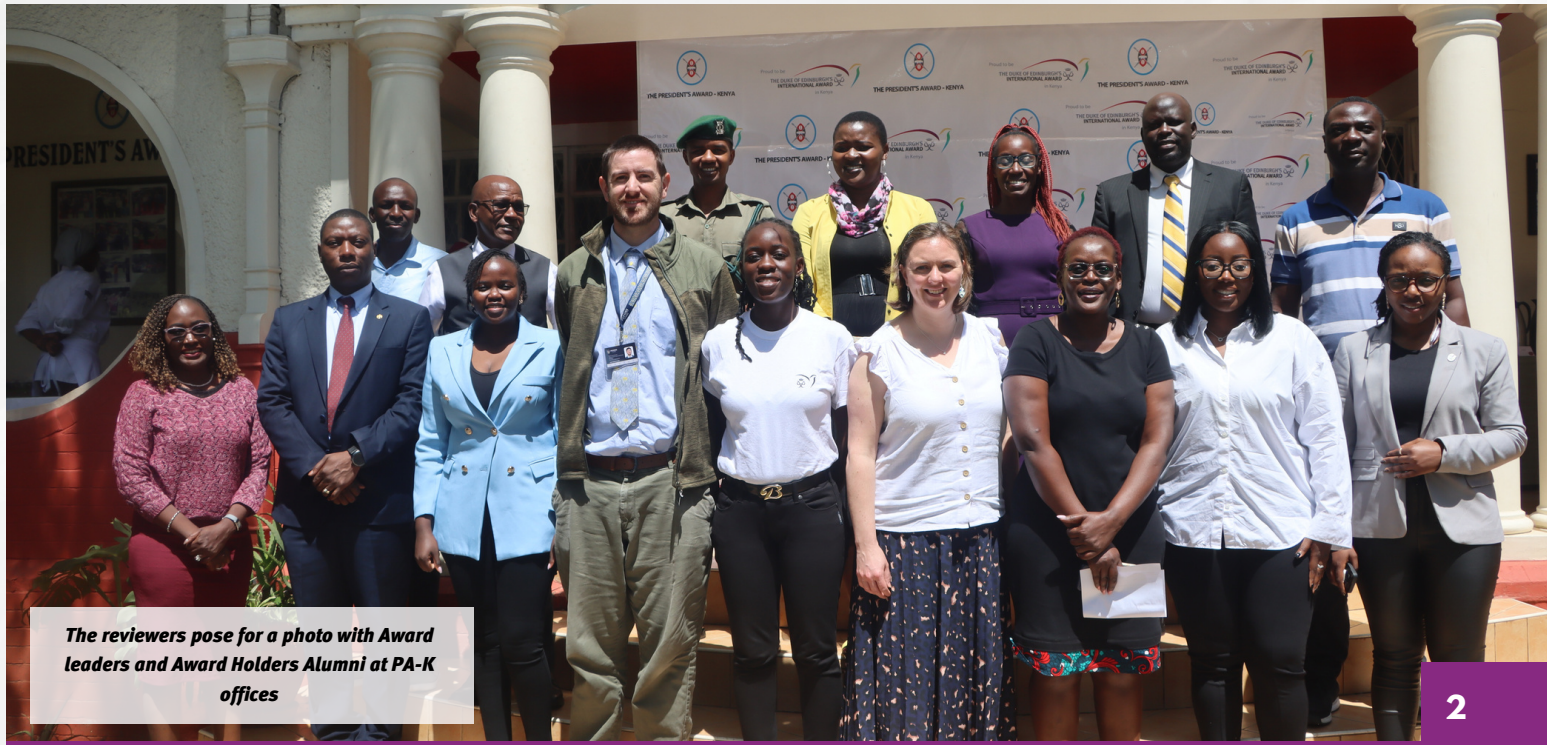
The reviewers pose for a photo with Award leaders and Award Holders Alumni at PA-K offices