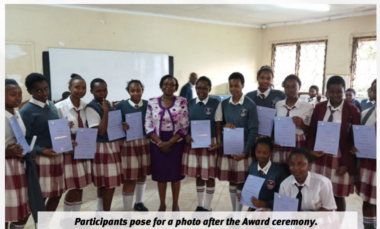
Participants pose for a photo after the Award ceremony.

The Chogoria Girls High School ceremony served as a powerful reminder of the transformative power of the PA-K program. It is a testament to the unwavering dedication of our educators, volunteers and program staff who guide and support young Kenyans on their paths to self-discovery and leadership.