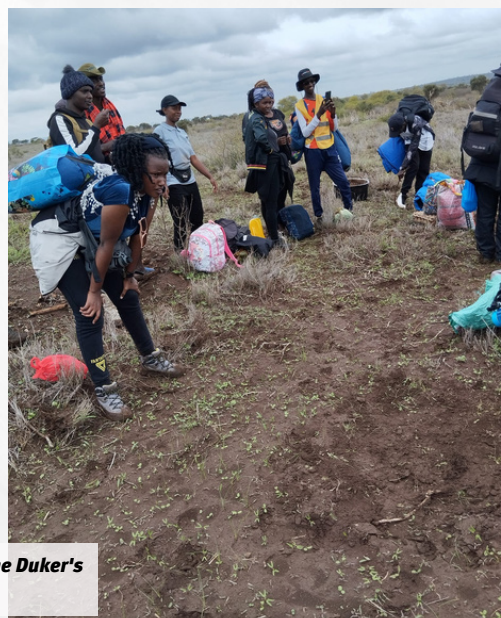
Award participants taking part in various activities during their visit at the Duker's Emboloi Education Centre