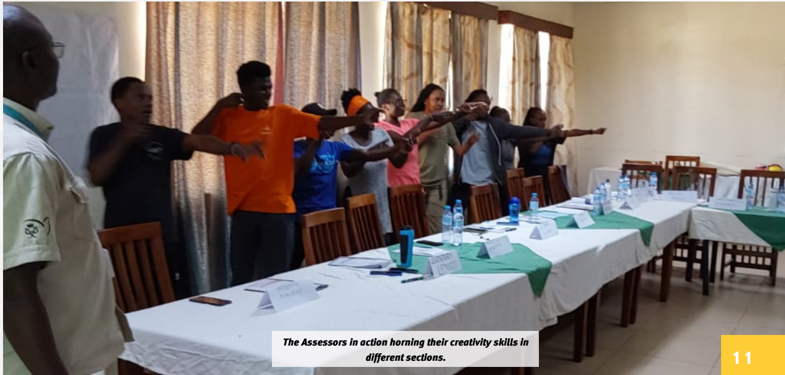
The Assessors in action honing their creativity skills in different sections.