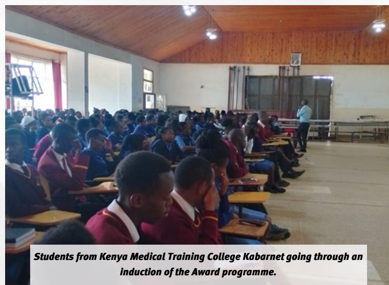
Students from Kenya Medical Training College Kabarnet going through an induction of the Award programme.

The enthusiasm of PA-K resonates with the organization's unwavering commitment to ensure that every young person experiences this prestigious life changing programme. Through this proactive initiative, PA-K's transformative impact continues to touch the lives of countless young Kenyans and the generations to come.